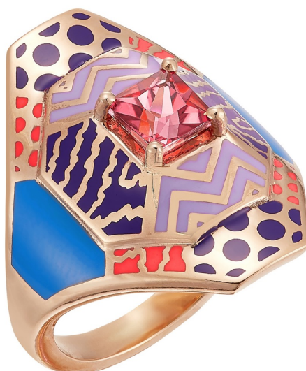
Alice Cicolini Jacobean Dot Shield ring, £3,720