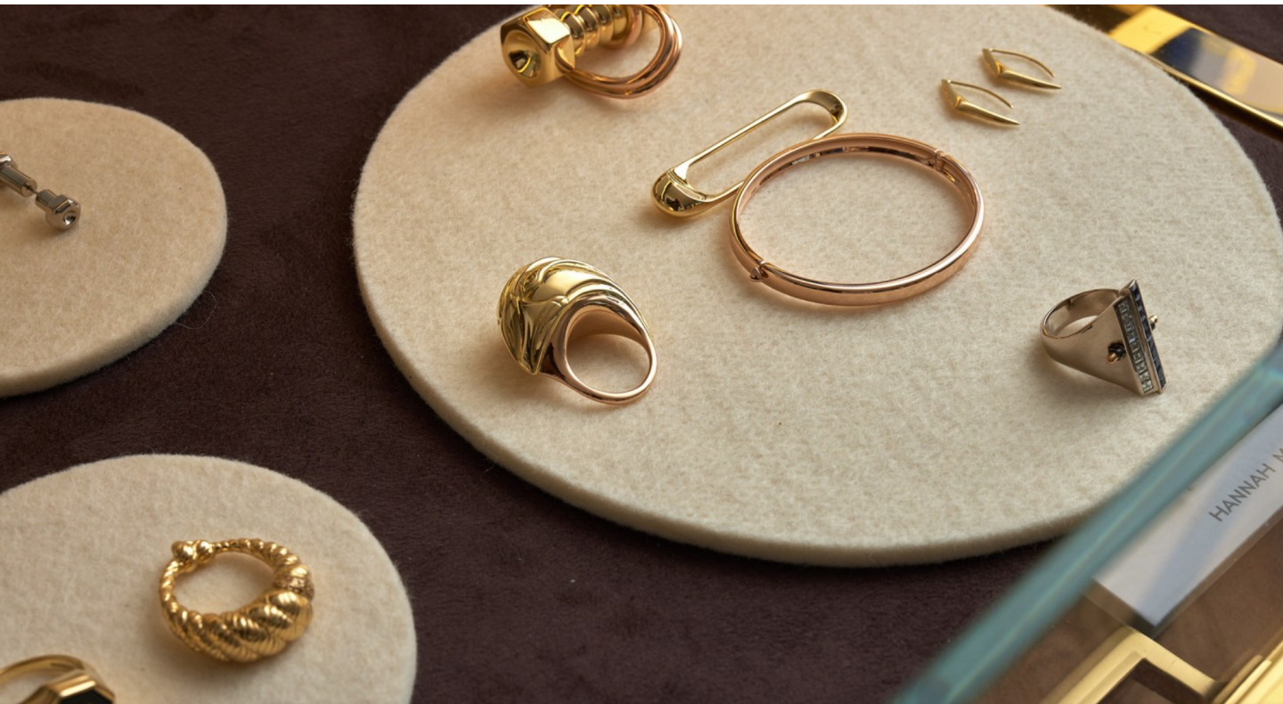
Jewellery at Louisa Guinness Gallery