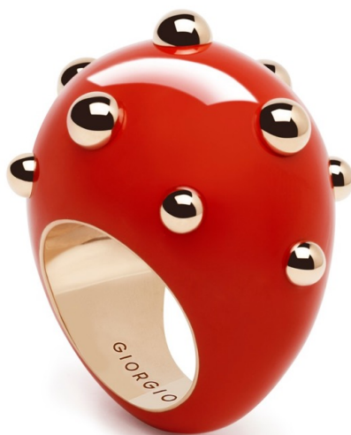
Giorgio Bulgari Giorgio B Goccia enamel ring, £6,000