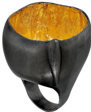
Emefa Cole Vulcan Series Caldera ring, £6,500