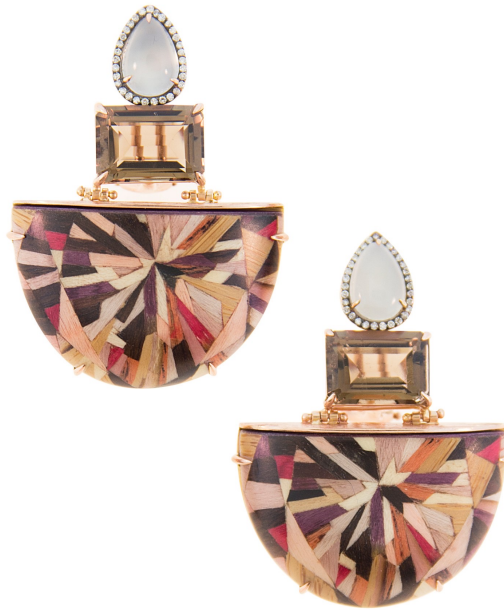
Silvia Furmanovich wood earrings, £9,690

With a new location comes a new focus, this time on contemporary jewellers. "For the past couple of years at Christmas time I've curated a small show called Things I Love," she says. "My clients really liked that idea of my selection of current jewellers, and this," she explains gesturing around her, "is basically that – things that I love."