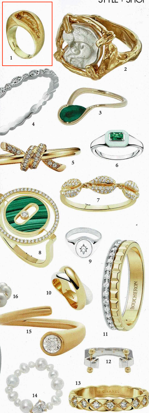
1 Gold ring, price on request, EMEFA COLE 2 Ring, £295, ALIGHIERI 3 Gold and emerald ring, £4,200, FERNANDO JORGE 4 White gold and diamond ring, £750, MARIA TASH 5 Gold and diamond ring, £2,150, TIFFANY & CO 6 Ring, £98, THOMAS SABO 7 Gold and diamanté ring, £2,288, ALAMASIKA 8 Gold and malachite ring, £2,070, MESSIKA 9 Ring, £40, NU & MII 10 Ring, £85, MISSOMA 11 Yellow and white gold and diamond ring, £4,790, BOUCHERON 12 Gold ring, £1,665, EERA 13 Gold and diamond ring, £3,430, CHANEL FINE JEWELLERY 14 Ring, £175, COMPLETEDWORKS 15 Ring, £150, MONICA VINADER 16 Ring, £175, ANISSA KERMICHE 17 White gold and diamond ring, £4,680, BULGARI 18 White, rose and yellow gold ring, £1,500, CARTIER 19 Gold and diamond ring, £4,348, RAINBOW K at MATCHES 20 Gold, diamond and mother-of-pearl ring, £2,350, DIOR JOAILLERIE 21 Ring, £40, NU & MII

Give old-money style a new-gen makeover by wearing a little-finger ring in a dainty design, with gleaming gemstones or natural pearls